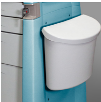
Waste with Lid