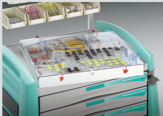
Divider Drawer Tray