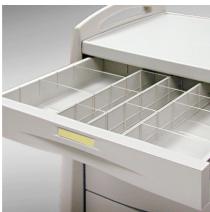
3" Drawer Divider (1)