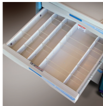
3" Drawer Dividers (Set of 2)