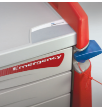
Tamper Evident Seals (100)