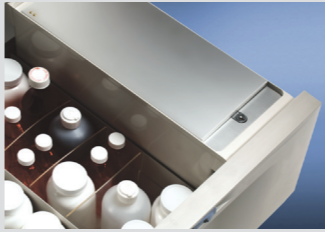
Internal Lock Box