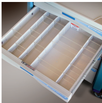
3" Drawer Dividers (Set of 3)