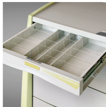
3" Drawer Dividers (1)