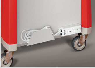
Plug Outlet Strip UL1363A Rated