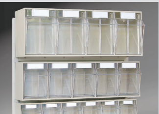
Tilt Bin Organisers