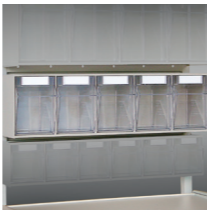
Tilt Bin 5 Bin Unit