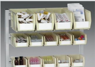
Bulk Storage Bins