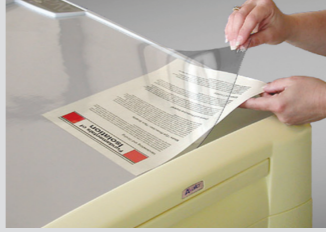
Clear Top Mat