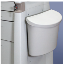
Waste Bin with Lid

Dark crème with key lock | GC4400 Dark crème with keyless | GC4500