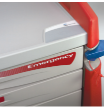
Tamper Evident Seals (100)