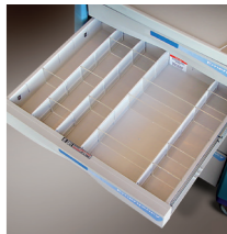
3" Drawer Dividers (Set of 2)