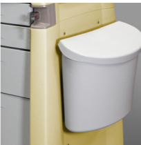
Waste Bin with Lid