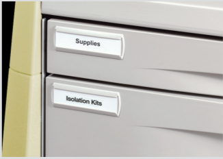
Drawer Tag Holder