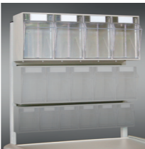
Tilt 4 Bin Unit